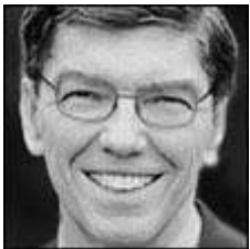
Clayton M. Christensen is the Kim B. Clark Professor of Business Administration at Harvard Business School.

In a very real sense, too many executives have outsourced the job of managerial judgment and decision making to this convenient—but ultimately unnutritious—tool. One simple way to put it in its proper place is to resolve never to begin or end an investment conversation with reference to a spreadsheet.